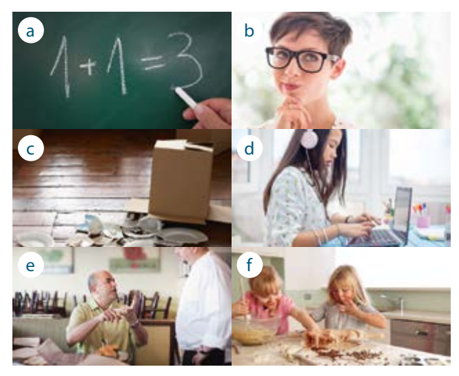
➤ Go back to page 87.